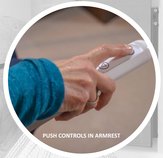
PUSH CONTROLS IN ARMREST