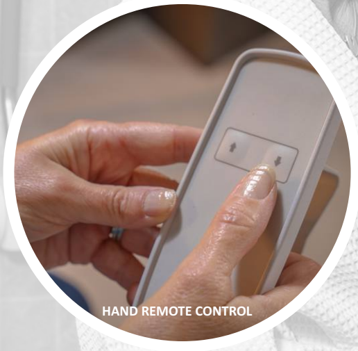
HAND REMOTE CONTROL